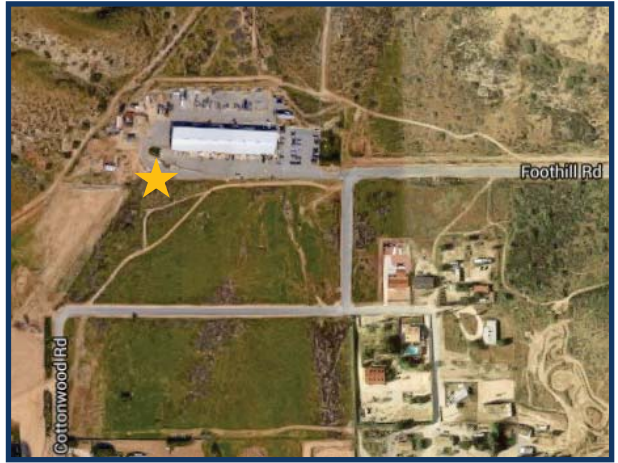
Morongo Public Works Drop Off Area 47350 Foothill Road

Collection bins are located at the far west end of the Public Works yard. Please strap down loose items and cover loads to prevent litter on the reservation.